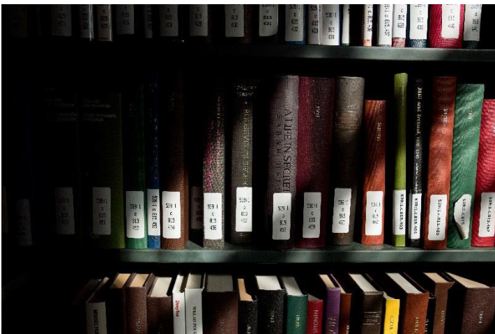
Library